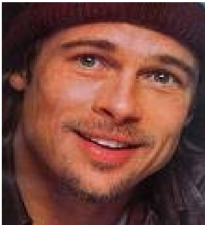
Brad Pitt – 'knows someone with a motorcycle' – allegedly