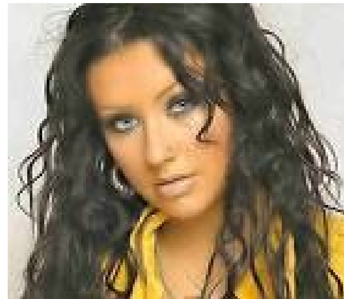
Christina Aguilera: Knee-down action lover