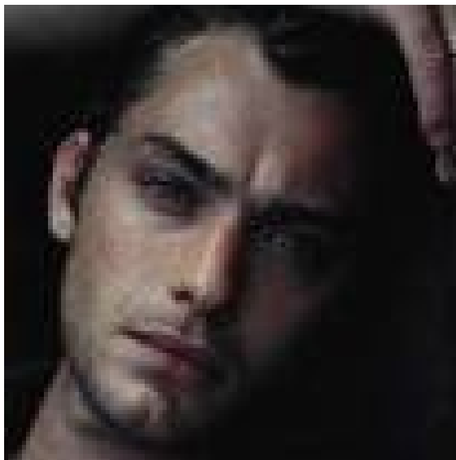
Jude Law pictured yesterday, size 50 helmet out of shot – Fancied for WSB Champion in 2008?