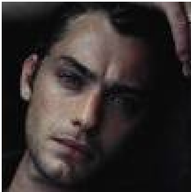
Jude Law pictured yesterday, size 50 helmet out of shot – Fancied for WSB Champion in 2008?